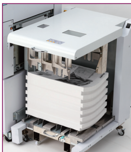
3,000-sheet receiver with adjustable jogging pressure for straight/offset stacking