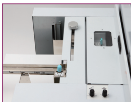
Unique air-suction feeder for reliable feeding