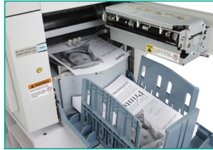
Air-Assisted Sheet Separation; Unique Receive Tray design assures quick drying time.