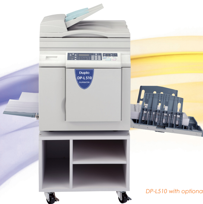
DP-L510 with optional ADF

Duplo's Affordable, Feature-Rich Digital Duplicator