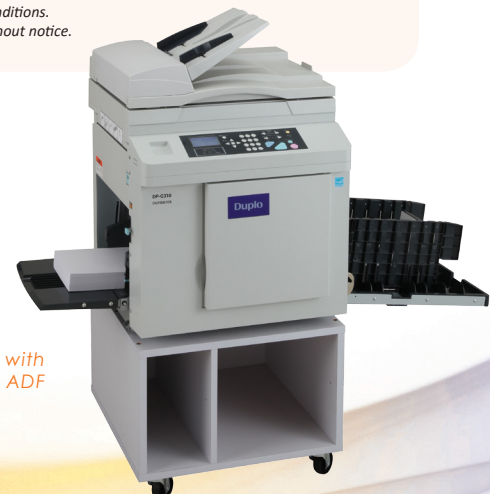
DP-G310 with optional ADF

All rights reserved. No part of this document may be produced without permission of Duplo USA Corporation.