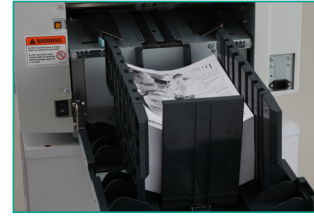
Improved Stacking Performance The U-shaped receiving tray stacks the prints neatly.