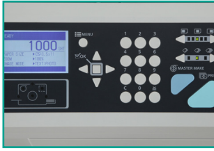
Large LCD Panel User-friendly control panel simplifies operation.